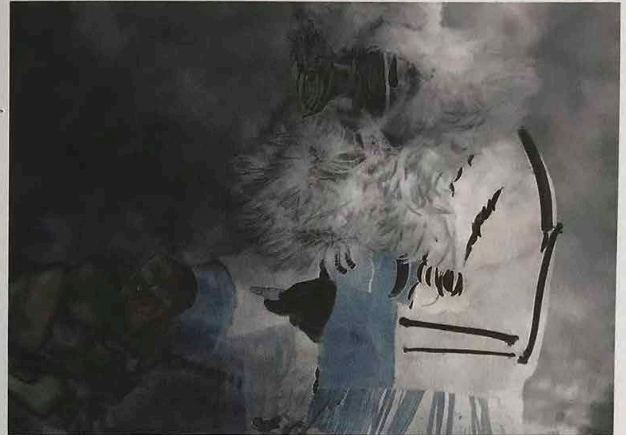
Ritual Dream of the Shaman