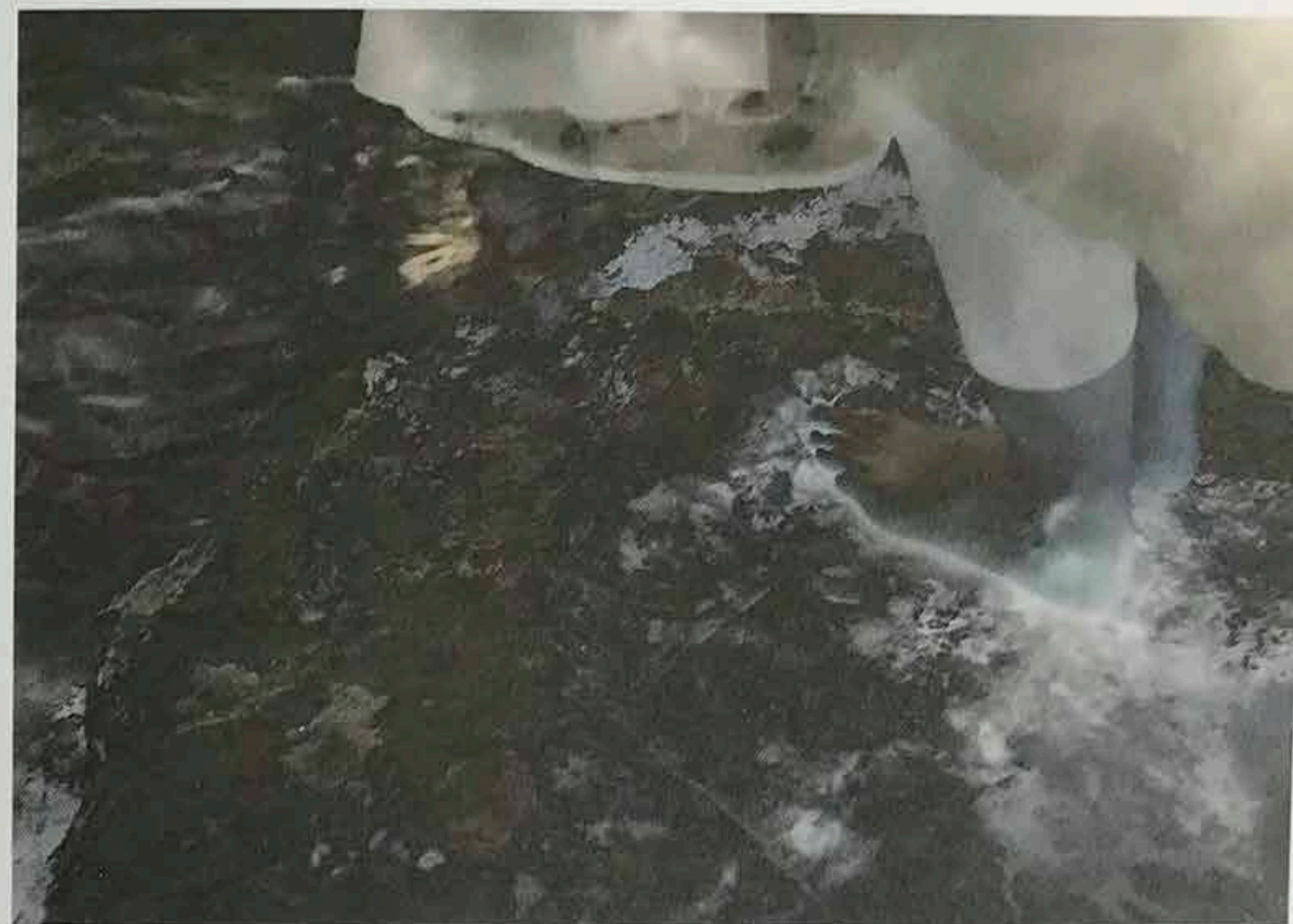
Ritual Dream of the Shaman Video installation 2019